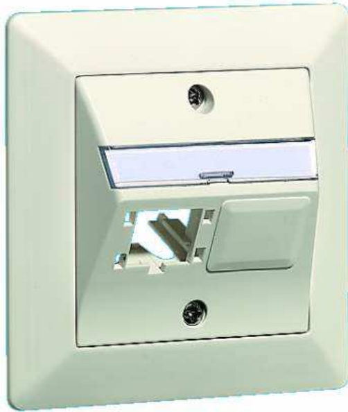
R&M FM Global Outlet